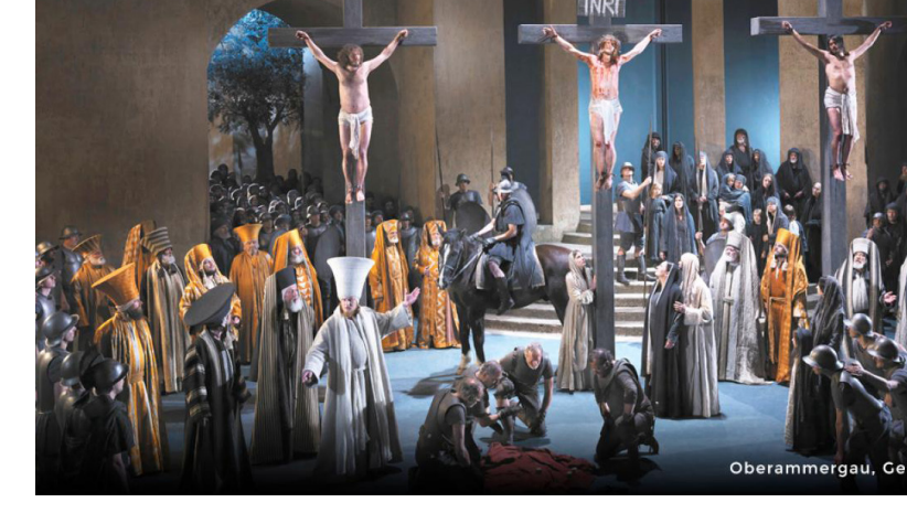
Evening: Overnight at the hotel in Oberammergau or vicinity

Alotting where we visit the Gnadenkappelle "Grace Chapel" housing the statue of the smiling Madonna of Altotting. Celebrate Mass at the Shrine of Altotting. Continue to the charming town of Oberammergau. The story of Oberammergau is one of faith and began with a miracle. In the 1600's "The Black Plague" swept through Europe, striking down one in every three people and leaving in its wake, misery, panic and death. The people of Oberammergau prayed to be spared, vowing that they would present a play depicting the Life and Passion of Jesus Christ every 10 years. True to their word, the villagers presented their Passion Play in 1634 and have kept their pledge, the routine of plays only having been interrupted by the two World Wars.